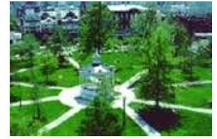
Medina is family-oriented community!