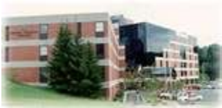
Medina General Hospital