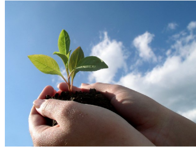
VOLUNTEERS PLANT THE SEEDS OF KINDNESS!

We had volunteers from UPS spend Friday, June 20th at our Summit County Crisis Center. The seven dedicated workers painted our front porch, cleaned the weeds out of our playground area, and lifted our spirits with their big smiles. Thank you United Way and Akron UPS!!